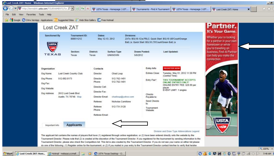
Figure 1: Online Tournament Homepage